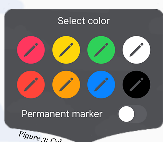
Drawing type selection