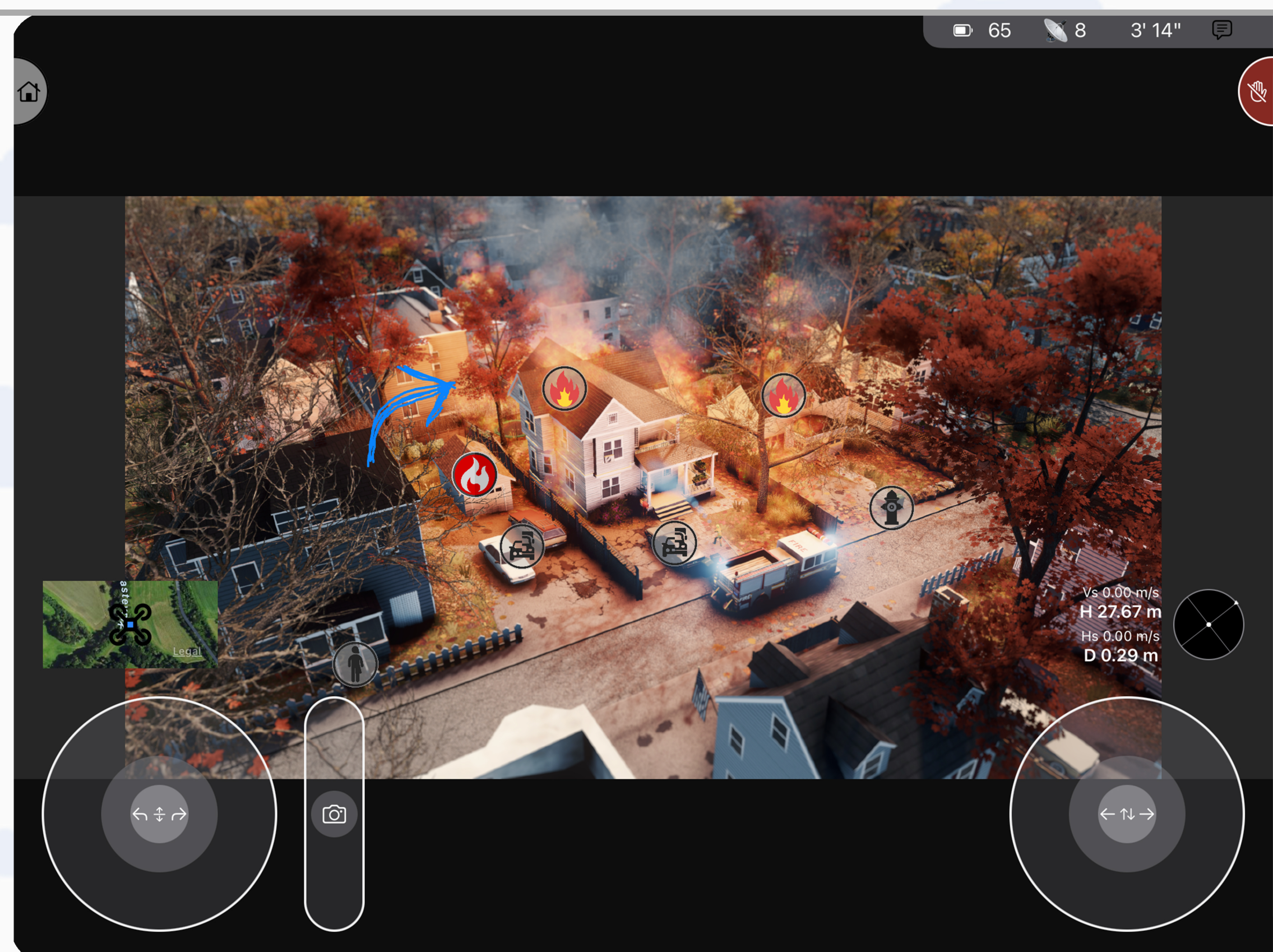
Figure 2: Commander app