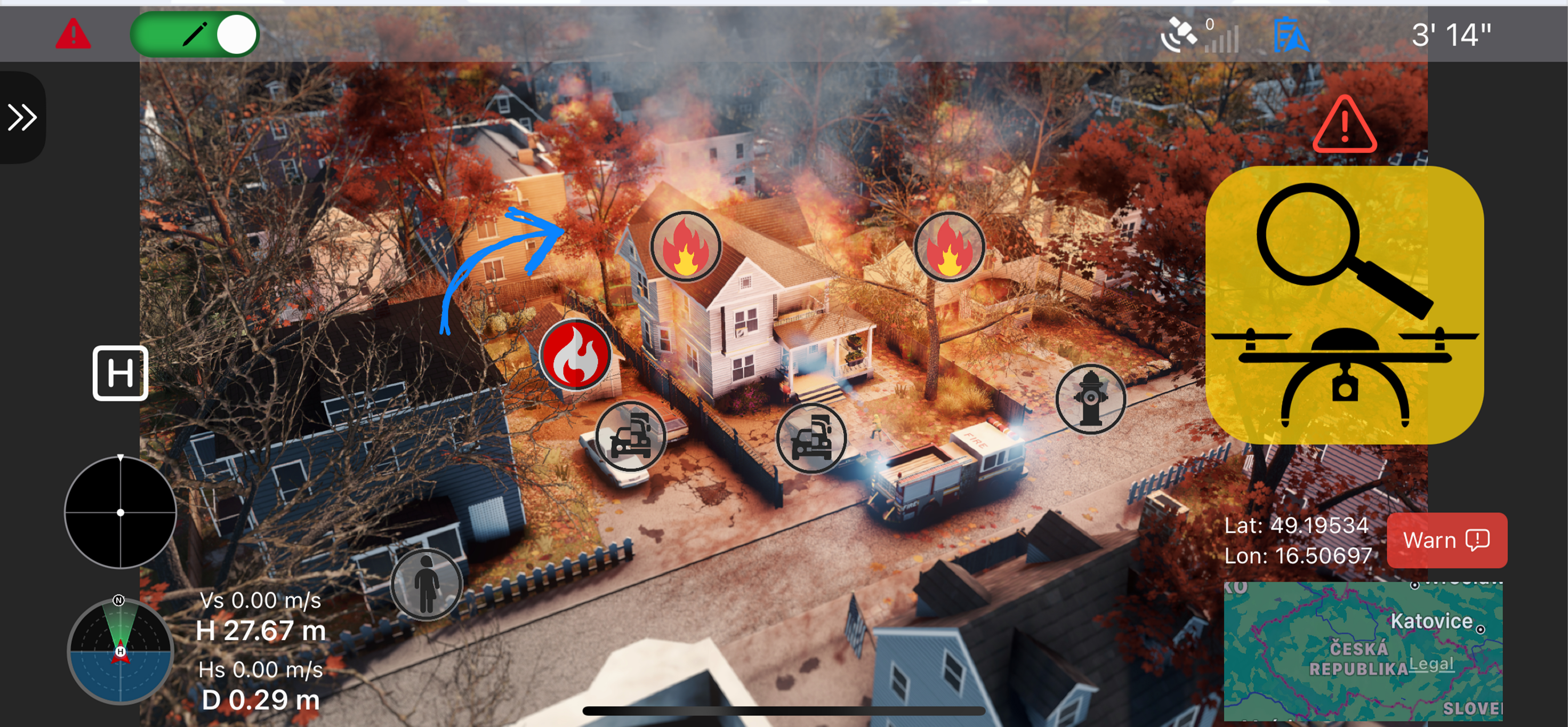
Figure 1: Pilot app