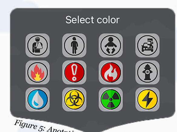
dragNdrop icon selection